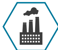
Large Commercial & Industrial